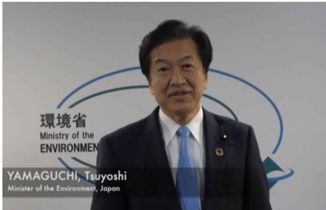
YAMAGUCHI, Tsuyoshi Minister of the Environment, Japan