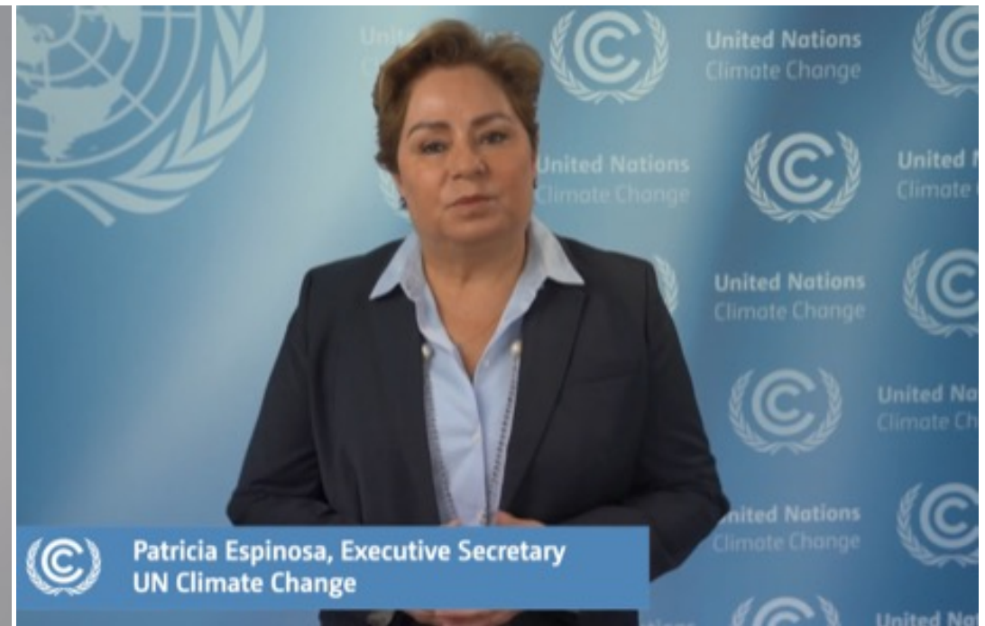
Patricia Espinosa, Executive Secretary UN Climate Change